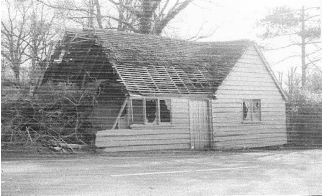
Toll Cottage 1968, lorry damage