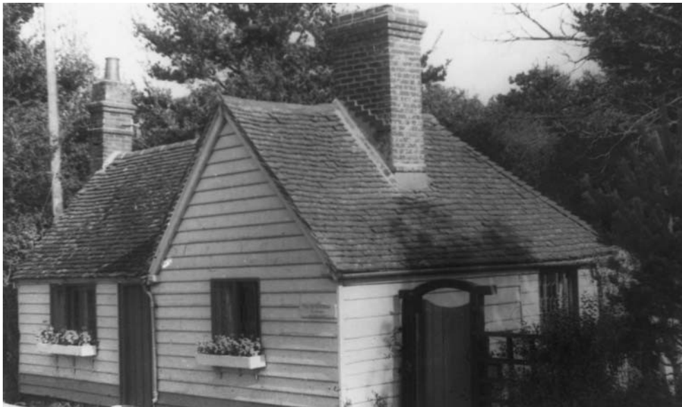
Toll Cottage pre-1968

The turnpike road from Beeding to Shoreham was initiated by an act of Parliament in 1807. Tolls continued to be collected until 1885. Further information is given in Chapter 17 of "Beeding - History of a Village" and in Brian Austen's article "Turnpikes to Steyning, Henfield and Shoreham" in Sussex Industrial History No. 40, 2010.