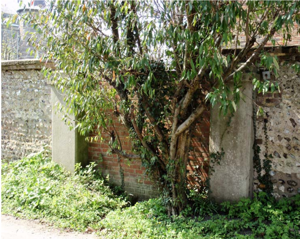
Gateway, Hyde Street